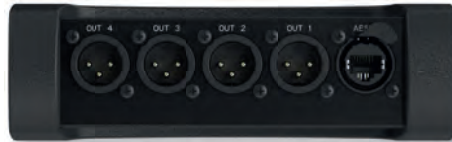
NA-4I4O-AES72 / back