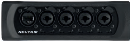
NA-4I4O-AES72 / front