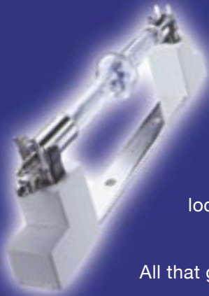
OSRAM SFc10-4 pre-focus socket

You know the powerful OSRAM SharXS® HTI® lamp. Now meet its mate. The OSRAM SFc10-4 pre-focus socket takes performance to new depths. Versatile and easy to use, the socket can be wired from the left or right side, and works with SharXS HTI lamps. A special key-lock feature pre-focuses the lamp for accurate insertion every time.