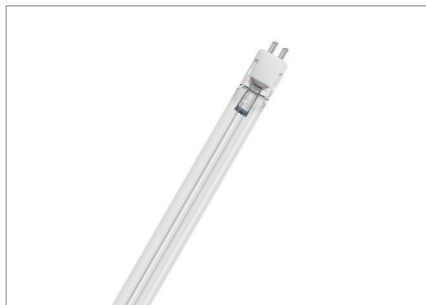
Linear PURITEC® HNS® UV-C Light