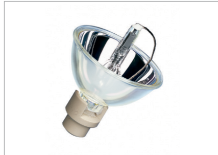
Excellent Xenon Light XBO® 100 W, 180 W, R 300 W