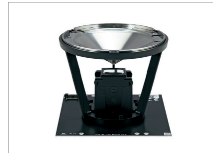
ITOS® ME/W LED Module