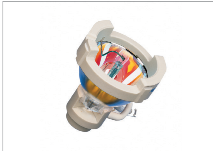
Optimized UV & Blue Light with Long Life HXP® R 120 W UV