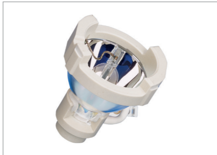
UV, Blue & White Light with Long Life HXP® R 120 W VIS, 200 W