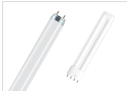
OSRAM BLUE lamps