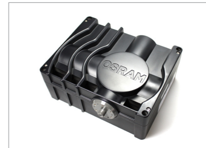
ITOS® PHASER 3000