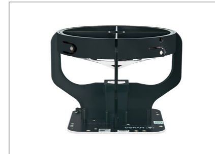
ITOS® ME/W PLUS FZ LED Module