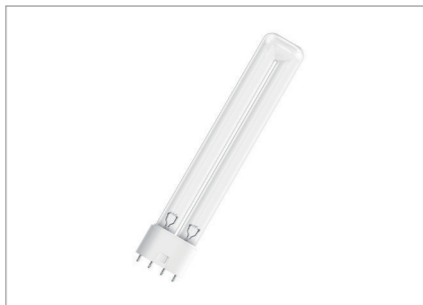
Compact PURITEC® HNS® UV-C Light