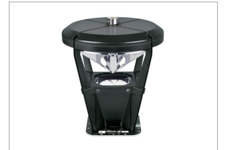
ITOS® SL/W LED Module