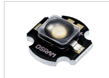
Curing Blue Light Power LED DO BDL 8 W M